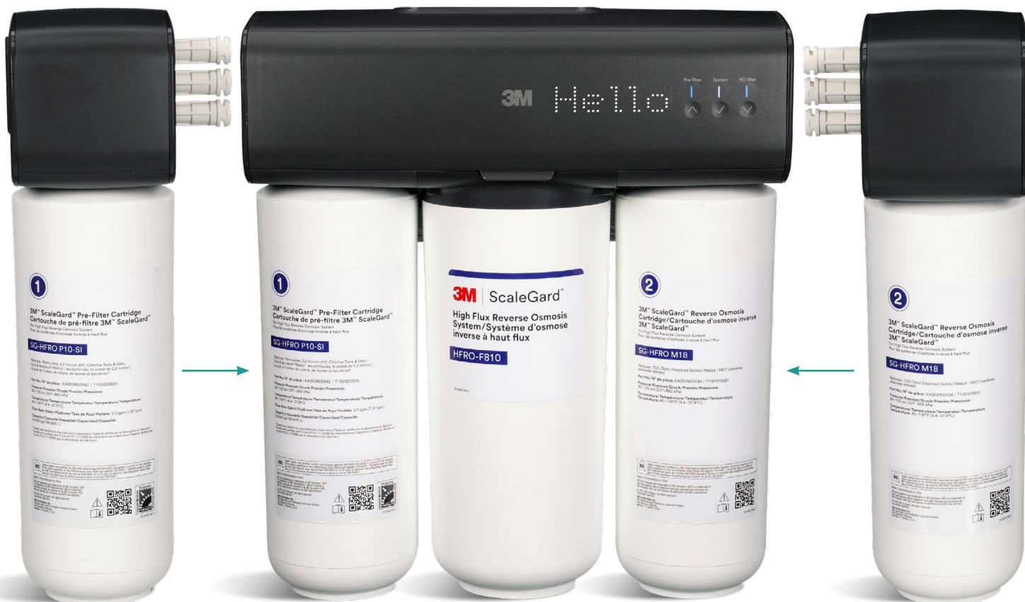
PRE-FILTER EXPANSION SET

Throughout your operation, the 3M™ ScaleGard™ High Flux Reverse Osmosis System is engineered to evolve with your changing water quality and capacity demands.