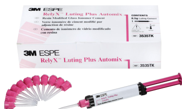
RelyX™ Luting Plus Automix — Trial Kit (3535TK)