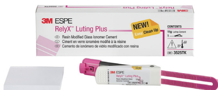
RelyX™ Luting Plus Clicker™ Dispenser — Trial Kit (3525TK)