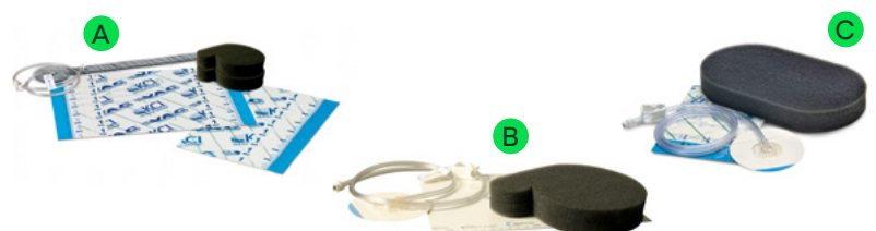
Figure 1 – ROCF Dressing Kits applied by participants: (A) ROCF-XG (B) ROCF-S (C) ROCF-g