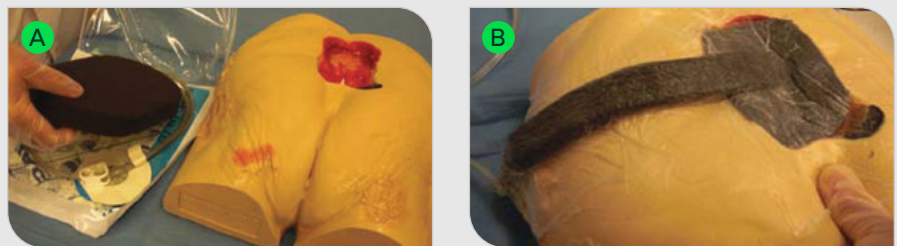
Figure 2 – An example of a bridging technique pre (A) and post (B) using ROCF-G dressing over a sacral wound on Seymour II-0910 model.