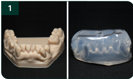
Resin-printed model of the wax-up for the first silicone matrix for injection of teeth 32 and 41.

Refer to instructions for use (IFU) for complete product information.