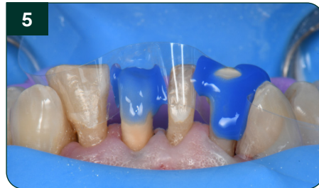
Protection of teeth 41 and 32 with mylar strip matrix, placement of a retraction cord and enamel etching for 15 seconds.