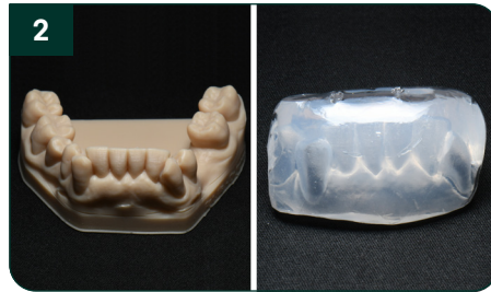
Resin-printed model of the wax-up for the second silicone matrix for injection of teeth 31 and 42.