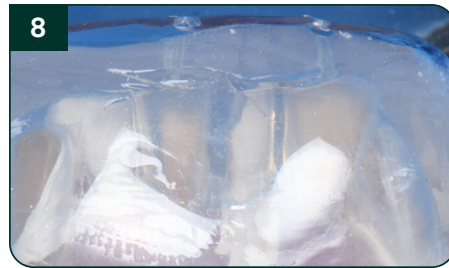
Seating of the first silicone matrix and injection with Solventum ™ Filtek ™ Easy Match Flowable Warm shade, followed by light-cure.