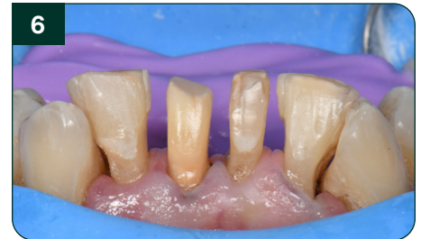
Application and light-curing of 3M ™ Scotchbond ™ Universal Plus Adhesive.