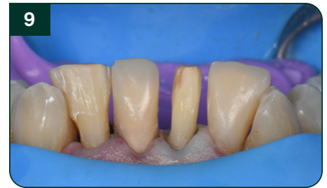
Removal of the first silicone matrix, followed by careful finishing and polishing. Same procedure is followed for 42 and 31.