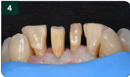
Minimally invasive buccal preparation of teeth 41 and 32 to provide a minimum thickness of approximately 0.5–0.7 mm.