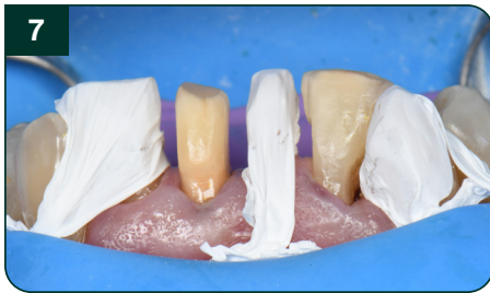
Placement of PTFE tape on teeth adjacent to those being injected.