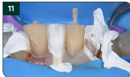
Clinical situation after removal of the second silicone matrix.