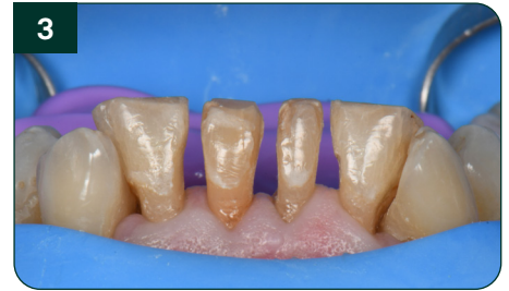
Isolation with split rubber dam.