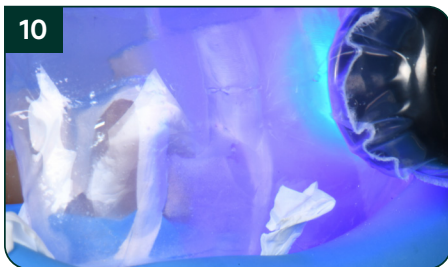
Seating of the second silicone matrix and injection of teeth 42 and 31 with Solventum ™ Filtek ™ Easy Match Flowable Warm shade, followed by polymerization.