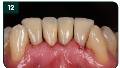
Immediate post-operative buccal view after finishing and polishing.