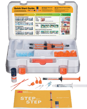
RelyX Universal Resin Cement Intro Kit (56968)