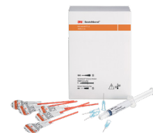
Scotchbond Universal Plus Adhesive Unit Dose 100 L-Pop (41298)

Unit Dose: For efficient hygiene management. Reduces the risk of cross-contamination.