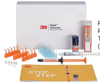
RelyX Universal Resin Cement Trial Kit TR (56969)