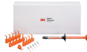
RelyX Universal Resin Cement Refill TR (56971)